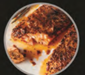
Marinated Salmon Fillets