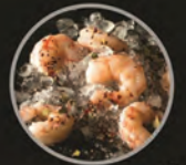
Wild Argentinian Red Shrimp