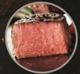
Butcher's Cut Filet Mignons

There's nothing better than selecting the mouthwatering package of your dreams—except eating it, of course. Stock up on even more delicious selections at OmahaSteaks.com/Collection .