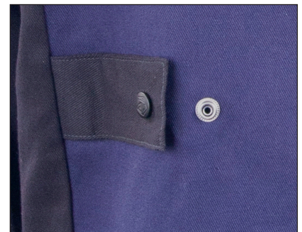
Waist Adjustment Snaps provide for a more personalized fit