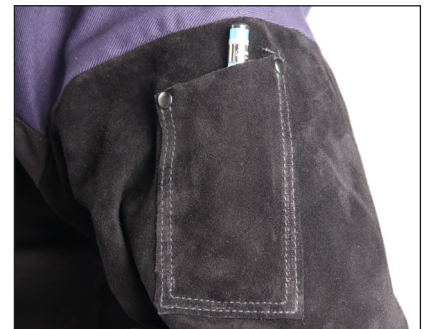
Scribe Pockets on Both Sleeves hold markers, pens, etc.