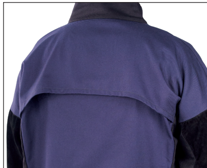
Back Ventilation Flap allows for heated air to escape