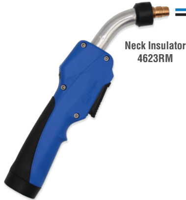
Neck Insulator 4623RM