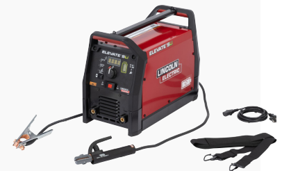
Base Model K4706-1