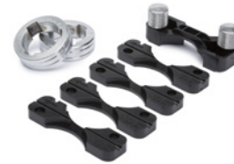
Aluminum (U-Groove) KP1695-3/64A shown