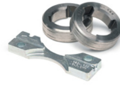
Solid Wire (V-groove) KP1696-045S shown