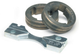
Cored Wire (Knurled) KP1697-045C shown