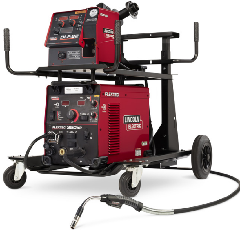
Shown: K5335-1 Flextec 350XP / DLF-82 Ready-Pak