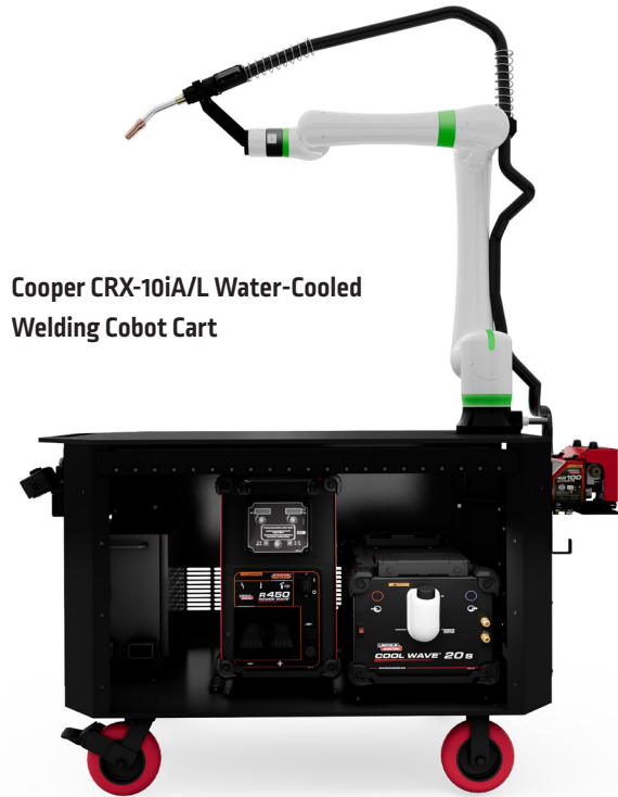
Cooper CRX-10iA/L Water-Cooled Welding Cobot Cart