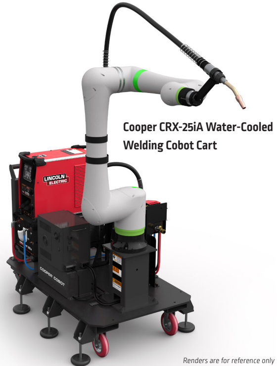
Cooper CRX-25iA Water-Cooled Welding Cobot Cart