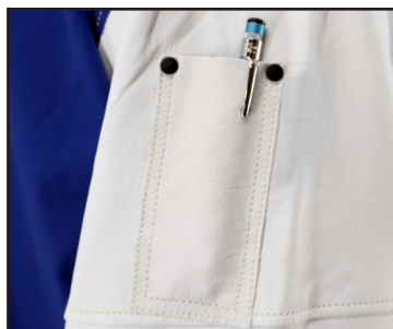
EXTERIOR SLEEVE POCKETS on both sleeves hold small items