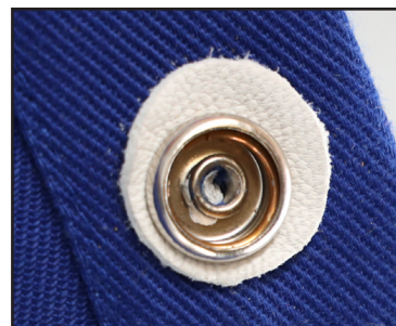
LEATHER REINFORCEMENTS on all front snaps offer protection from tearing