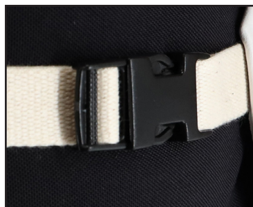
ADJUSTABLE WAIST STRAP with molded side-release buckle for a secure fit