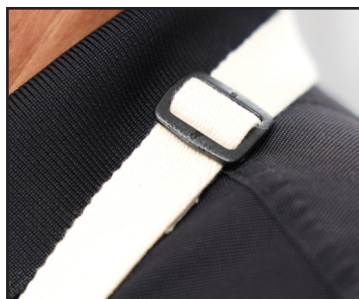
ADJUSTABLE NECK STRAP with tension lock slide buckle