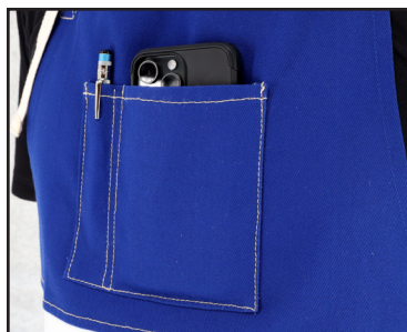
LARGE CHEST POCKET includes two compartments for holding pen, tools...